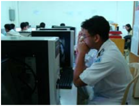
NSA Cadet taking evaluation exams as part of their regular evaluation