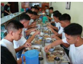
Lunch time after a long day