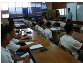
A lecture class in Intro to Marine Electro Technology Course