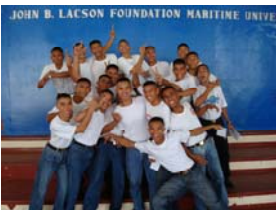
Keeping the spirit of being a young NSA Cadet