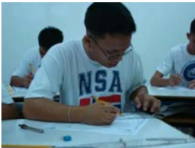
NSA Cadet doing his radar plotting exercise