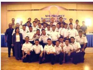
9th Batch Cdts. back to school again after their shipboard training