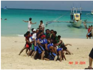
NIS Cadets group competition , a Team building Activity.