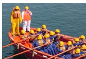
Boat Drills at T/S KFO