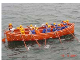
The 1 st Year NIS Cadets sure need more practice !