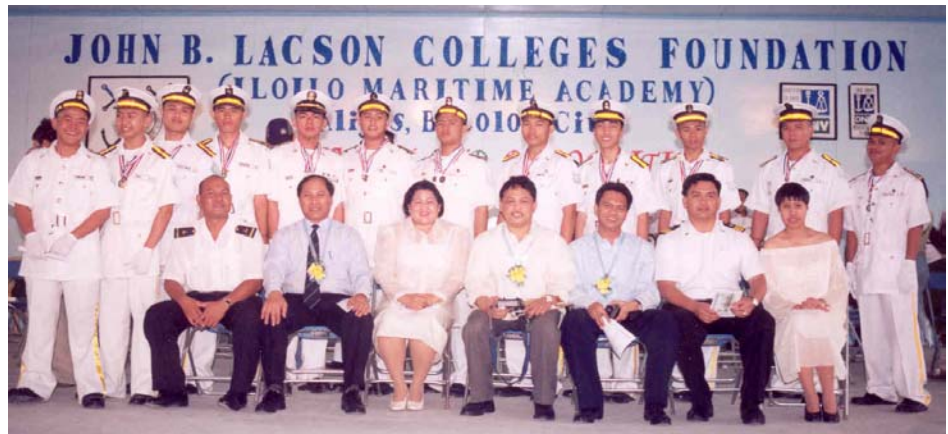
NIS Cadets with representatives from NTC-M, OSM, Stolt-Nielsen, Jebsen and Barber.