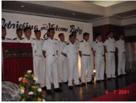
Debriefing ceremony for returning NIS Cadets