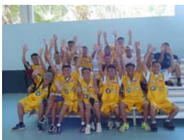
Basketball team from J.B. Lacson Arevalo