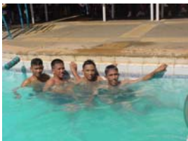
Winning team in the swimming competition